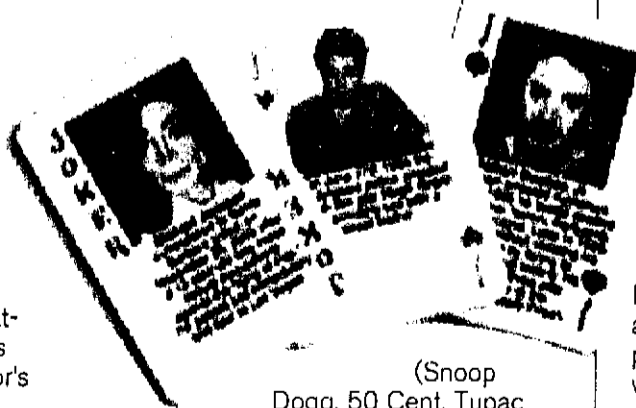
(Snoop Dogg, 50 Cent, Tupac Shakur, P. Diddy and Eminem) will give you three kings and a pair of aces. Nice hand.

Former and current NBA stars (Allen Iverson, Jason Kidd, Charles Barkley, Dennis Rodman and Kobe Bryant) yield a fairly worthless hand with an ace as its high card.